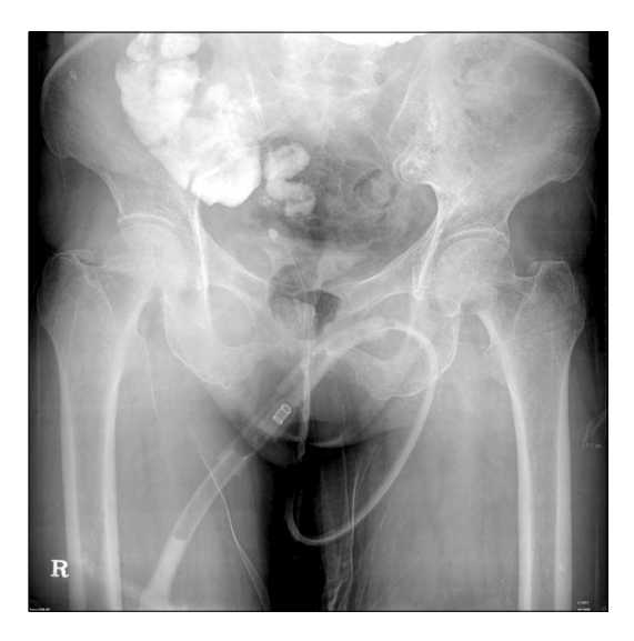
FIG. 1. Cystography revealed a fistula tract between the contracted urinary bladder and the terminal ileum.

Under the presumptive diagnosis of an enterovesical fis-