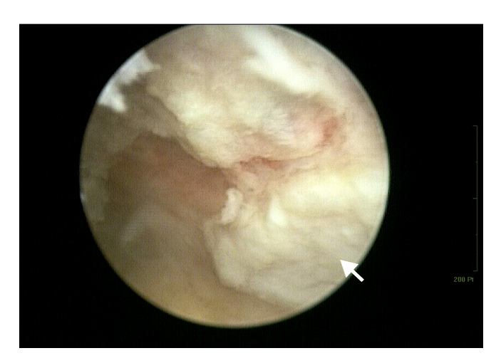
FIG. 3. Cystoscopy performed 2.5 years postoperatively. The bladder wall replaced with bovine pericardium (arrow) was observed to be relatively white with a coarse pattern.

BP was intact. At postoperative year 1, we removed the catheter. We persuaded the patient to undertake self-voiding and prescribed tolterodine 4 mg to control frequency. After administration of tolterodine for three days, she complained of abdominal distension and pain. Under the diagnosis of functional bowel obstruction due to the side effect of the anticholinergic action of tolterodine, conservative management was done for the bowel obstruction. The patient recovered without complications. After that, she refused further administration of anticholinergics because of the expected side effect of the drug. Her frequency problems still remained, so she wanted to restore the urethral Foley catheter to relieve the voiding symptoms and to change it every month instead of self-voiding with medication. The patient was followed every month in our clinic. Her follow-up blood urea/nitrogen level was 29/2.1 mg/dl. Cystoscopy was performed postoperatively 2.5 years later. The BP observed at the dome of the bladder wall remained intact (Fig. 3).