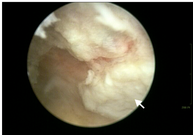
FIG. 3. Cystoscopy performed 2.5 years postoperatively. The bladder wall replaced with bovine pericardium (arrow) was observed to be relatively white with a coarse pattern.

BP was intact. At postoperative year 1, we removed the catheter. We persuaded the patient to undertake self-voiding and prescribed tolterodine 4 mg to control frequency. After administration of tolterodine for three days, she complained of abdominal distension and pain. Under the diagnosis of functional bowel obstruction due to the side effect of the anticholinergic action of tolterodine, conservative management was done for the bowel obstruction. The patient recovered without complications. After that, she refused further administration of anticholinergics because of the expected side effect of the drug. Her frequency problems still remained, so she wanted to restore the urethral Foley catheter to relieve the voiding symptoms and to change it every month instead of self-voiding with medication. The patient was followed every month in our clinic. Her follow-up blood urea/nitrogen level was 29/2.1 mg/dl. Cystoscopy was performed postoperatively 2.5 years later. The BP observed at the dome of the bladder wall remained intact (Fig. 3).