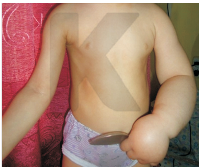
Fig. 1. Lymph edema of left upper extremity.

At the time of admission, the patient was conscious and her vital signs were within normal limits. Her height was 94 cm (90th centile according to the Center for Disease Control and Prevention [CDC] growth chart) and weight was 14 kg (between 75th–90th centile per the CDC growth chart). She had significant left-arm edema (without pain), limitation of motion, and difficulty with arm movement (Fig. 1). The circumferences of right and left arms were as