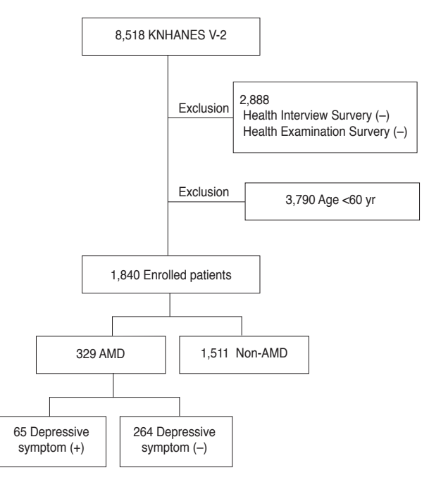
Fig. 1. Flow diagram of the study participants. KNHANES = Korea National Health and Nutrition Examination Survey; AMD = age-related macular degeneration.

vev of the health and nutritional status of non-institutionalized Korean people. It began in 1998, and surveys were conducted in 1998, 2001, and 2005, and also in 2007-2009 and 2010-2012. A stratified, multi-stage, clustered probability design was used to select a representative sample of civilian, non-institutionalized Korean adults. The KN-HANES consists of three parts: (1) a Health Interview Survey, (2) a Health Examination Survey, and (3) a Nutritional Survey. The Health Interview Survey was administered to all study participants, but the Health Examination Survey and Nutritional Survey were administered to only approximately one-third of the participants who were randomly selected from those who completed the Health Interview Survey. In all, 8,518 individuals participated in the 2011 KNHANES V-2. For our analyses, 2.888 participants were excluded because they did not finish the Health Interview Survey and/or the Health Examination Survey, and 3,790 were excluded because they were vounger than 60 years. This left 1.840 people aged 60 years and older who finished the Health Interview Survey and the Health Examination Survey and were therefore eligible for our analyses (Fig. 1).