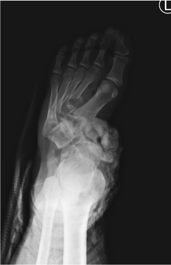
Fig. 1. Preoperative radiographic image showing 1 st –4 th metatarsal bone fractures with dislocation of Lisfranc, intertarsal, and transverse tarsal joints.

dislocations and a circumferential degloving wound on the midfoot. The midtarsal bones were severely comminuted, and the Lisfranc joint was completely disrupted (Fig. 1). The Mangled Extremity Severity Score (MESS) of the patient was 8 points, indicating the need for a leg amputation. However, our team elected to salvage and preserve the crushed foot after considering multiple factors, including the patient's age and pre-trauma activity levels. We fixed multiple metatarsal base fractures with Kirschner wires (K-wires) to achieve temporary bone fixation. After the bones were fixed, the 10 cm × 21 cm soft tissue defect was covered with a thoracodorsal artery perforator (TDAP) free flap on the day of the injury, mainly on the medial malleolus using the posterior tibial artery as the recipient vessel (end-to-side anastomosis). Ultimately, the flap survived in its entirety without complications.