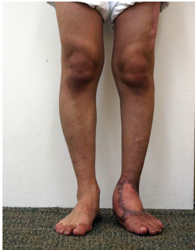
Fig. 4. Postoperative photograph of the patient's leg 7 months after surgery, showing a completely survived flap without complications.

The patient was able to start rehabilitation therapy, including non-weight-bearing activity for 6 weeks