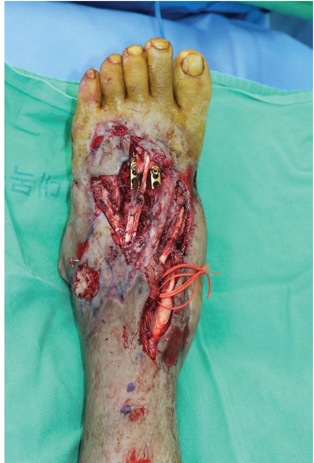
Fig. 2. Photograph displaying a 6 cm × 14 cm defect in the foot dorsum and exposure of the fixator with the previous thoracodorsal artery perforator free flap at the medial malleolus.

Two months after the initial operation, the patient underwent orthopedic surgery for permanent bone fixation after brisement manipulation of the ankle joint. After the surgery, all internal devices on the foot dorsum were completely exposed (Fig. 2). Consequently, we planned a second soft tissue reconstruction with an anterolateral thigh (ALT) free flap using the anterior tibial artery (ATA) as a recipient vessel. To cover the defect, a 10 cm × 8 cm ALT flap was harvested and prepared for microanastomosis to the ATA (end-to-side pattern). However, sudden weakening