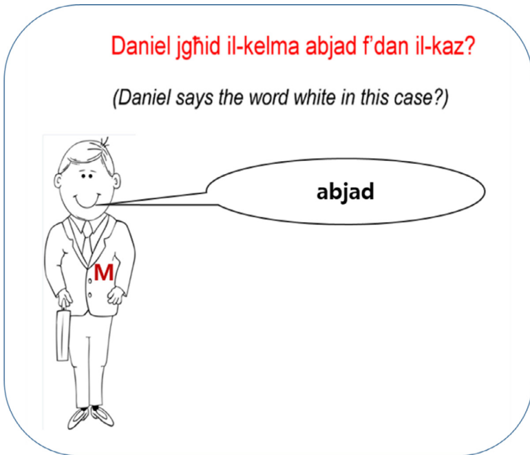
Fig. 1. An example prompt re-drawn based on Fig. 1 used in Experiment 1 in [1] in which the actual cartoon character looked different from the one used here. The English translation is given here but was not shown in the actual experiment. Participants were instructed to answer the question based on the information provided in the picture. The speaker is the cartoon character “Matthew” (as marked by ‘M’), so that the correct answer is Le, Matthew jgħid il-kelma abjad f’dan il-kaz (Engl. ‘No, Matthew said the word ‘white’ in this case’). The critical word abjad /abjad/ (Engl. ‘white’) in this example is vowel-initial, and therefore it could potentially trigger a glottal-stop epenthesis.

For the second factor to elicit the data, the strength of the glottal gesture in the stimulus was generated with a target continuum over the initial 50 ms of the vowel-initial target word, originally produced without any phonetic evidence of glottalization. This was also done using PSOLA in Praat. Starting from the original utterance with no cues for glottalization, we added pitch and amplitude drops to mimic the typical properties of glottalized vowels [14]. Pitch was lowered from 100 to 60 Hz, and amplitude was lowered from 100% of the original to 50% of the original in 6 steps.