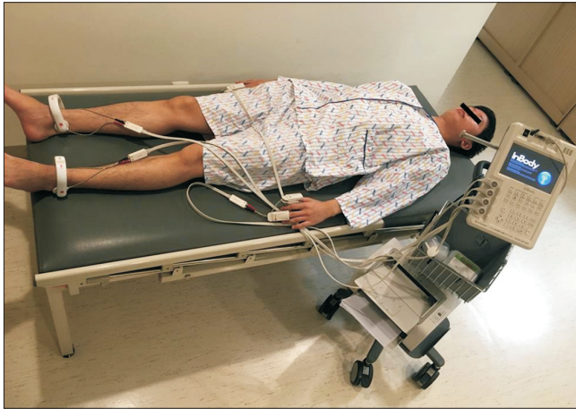
Fig. 3. Skeletal muscle mass was measured using bioelectrical impedance analysis (InBody S10; Biospace, Seoul, Korea). Surface electrodes of were at both ankles and fingers (thumb and middle finger).